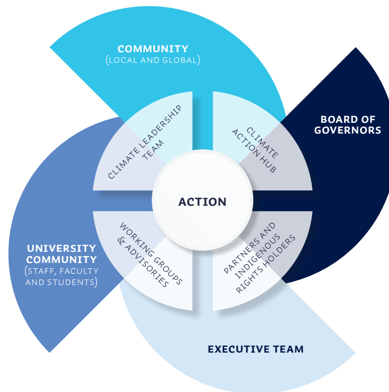
Figure 2. Royal Roads' Climate Action Leadership Model

As the Climate Action Plan evolves, the hub will coordinate new actions and serve as one of several important resources designed to amplify and support faculty, staff and student leadership work.