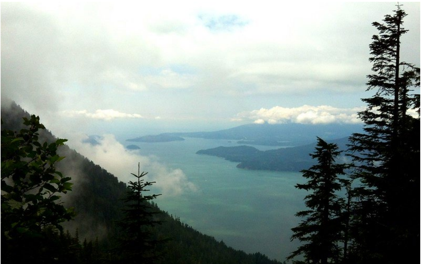
‘View of Howe Sound from the Lions Binkert Trail’ by Harold Cecchetti is used under Creative Commons license CC BY-SA 2.0 .

For more information: Visit the Office of the Privacy Commissioner of Canada Contribution Program 2026-27 website