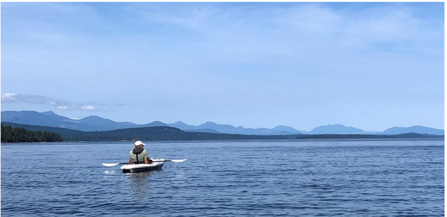
Off Galiano Island.