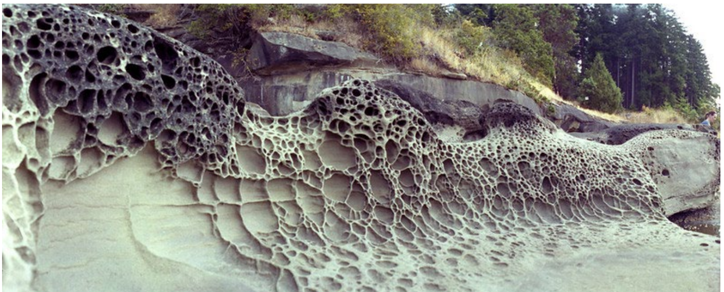
'Hornby Island' by Duncan Creamer is used under license CC BY-NC-ND 2.0 .

Please note: The principal investigator for any grant application submitted through Royal Roads University must be a core faculty member at RRU.