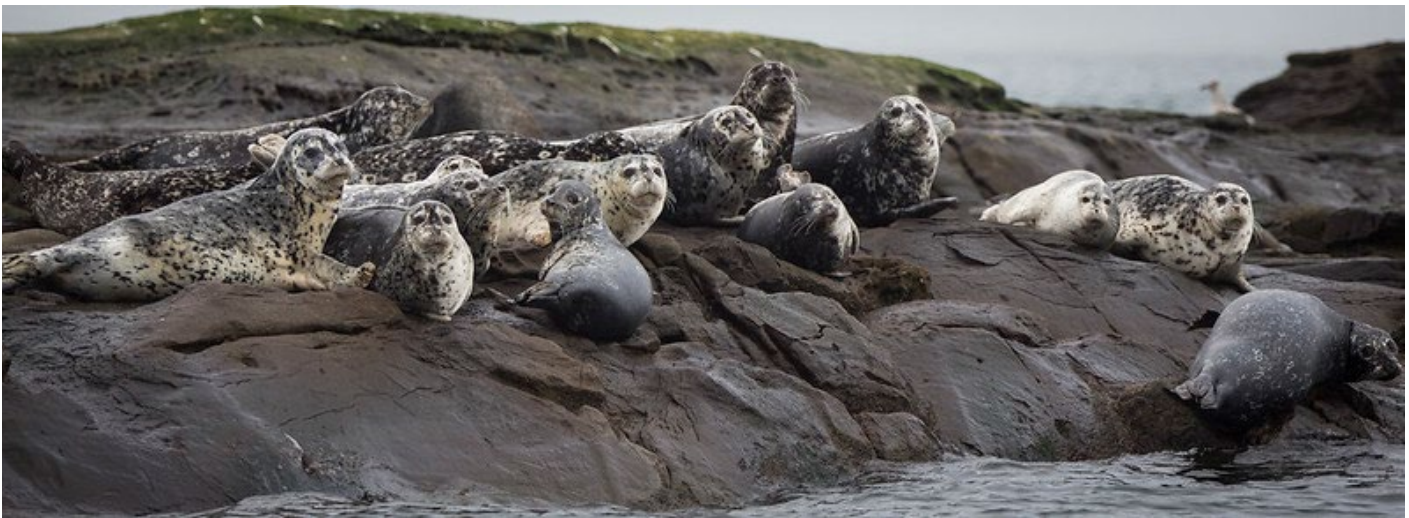
'JosephKing-20150108-BC-Jan2015-R62A0234' [Saturna Island, BC] by Joseph King is used under license CC BY-NC-ND 2.0 .