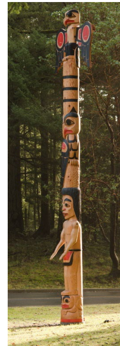
'Full Sael Pole view'