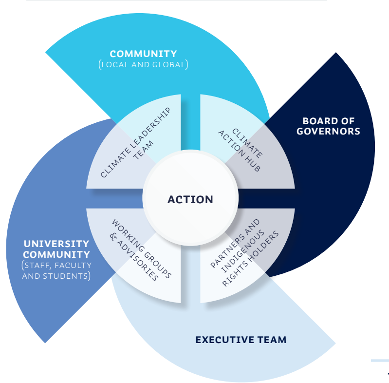
Figure 2. Royal Roads' Climate Action Leadership Model

As the Climate Action Plan evolves, the hub will coordinate new actions and serve as one of several important resources designed to amplify and support faculty, staff and student leadership work.